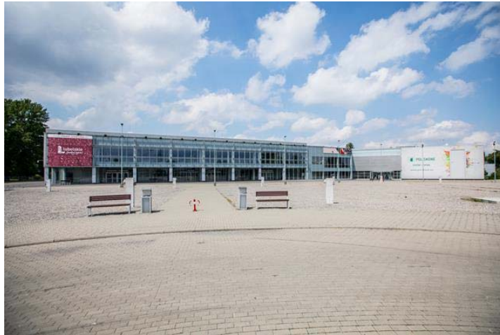
LUBLIN TRADE FAIR