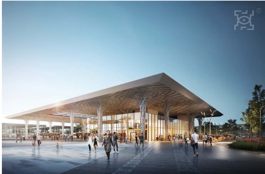
INTEGRATED METROPOLITAN TRANSPORTATION CENTRE VISUALISATION.