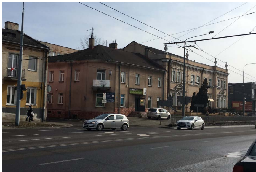
THE VIEW OF THE PROPERTY