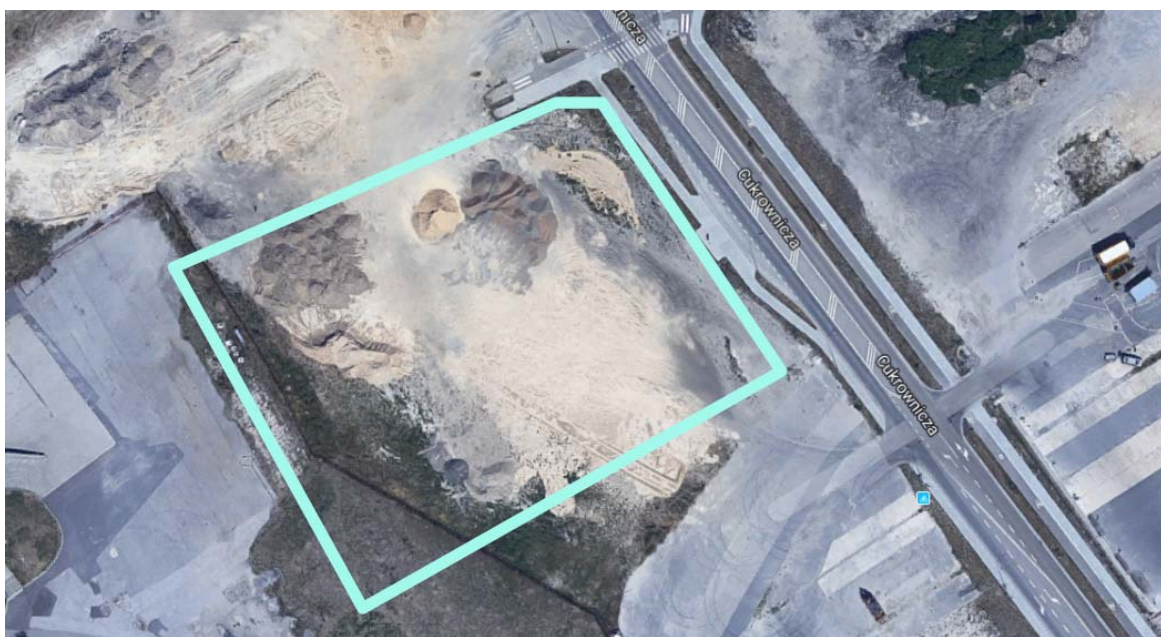
AERIAL VIEW OF THE PROPERTY