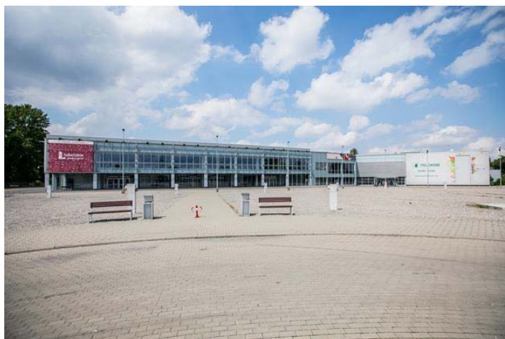
LUBLIN TRADE FAIR

The property is located in the close vicinity of the Lublin Trade Fair (300 m), Aqua Lublin (600 m), the Main Railway Station (planned to be expanded as the Integrated Metropolitan Transportation Centre - 150 m), Arena Lublin (300 m) and one of the main roads constituting the communication axis of the city - Lubelskiego Lipca '80 street.